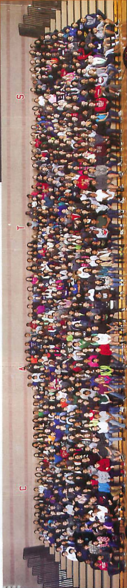
Large Panoramic 10" x 36" size

SUNSET HIGH SCHOOL - SENIOR CLASS OF 20XX