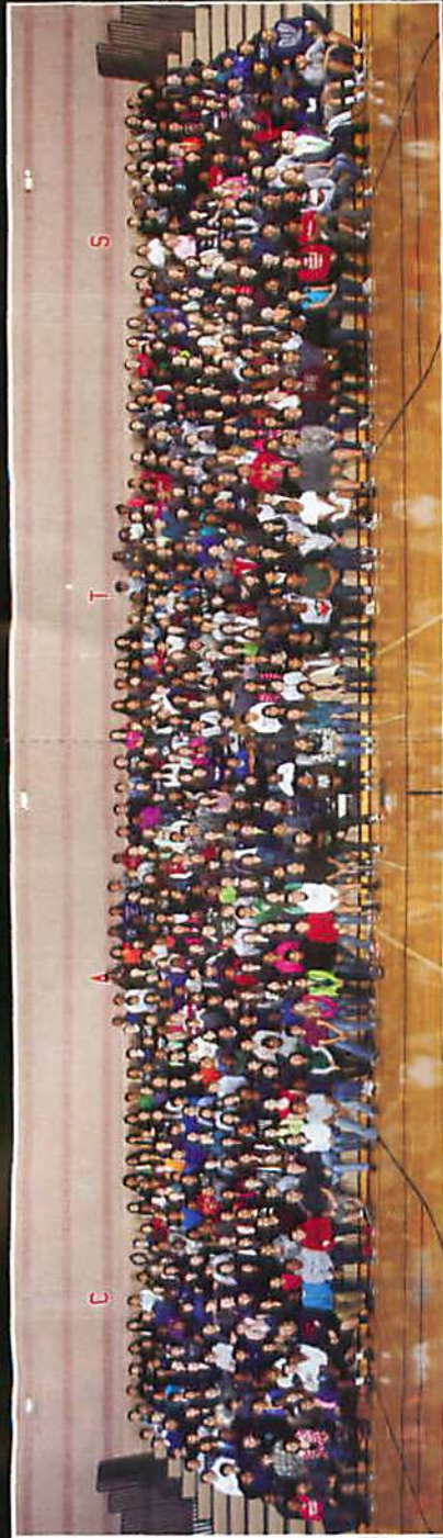
Small Panoramic 10" x 24" size